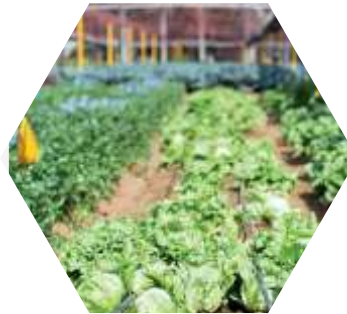
ORGANIC VEG FARM